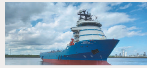
This is an indicative image of a typical survey vessel. The actual survey vessel used on the Project may differ.

Full details of any offshore surveys associated with our Project can be found in the Notice to Mariners (NtM), which will be issued prior to the surveys commencing. Copies of the notices will be available to view on our website: www.morecambeandmorgan.com/morecambe