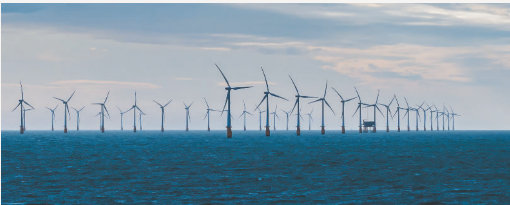
This is an indicative image of a typical offshore windfarm. The actual design of Morecambe Offshore Windfarm Generation Assets and Morgan Offshore Wind Project Generation Assets may differ.

During the consultation there will be a series of in-person and online events where people will have an opportunity to speak to the team, find out more about the proposals, and ask any questions they may have. At the start of the consultation, the Transmission Assets Project website will be updated and include all consultation materials and information on how you can take part.